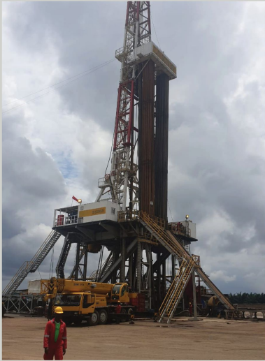
Oredo - 20 Well